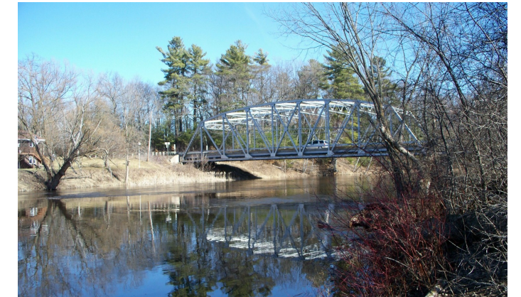
The old steel bridge on Highway 22, spanning the Wolf River in Belle Plaine, will be replaced starting in May.

"The steel truss bridge has been documented through the Section 106 historical process and will be dismantled by the contractor," McHugh said. "Some steel elements of the structure are